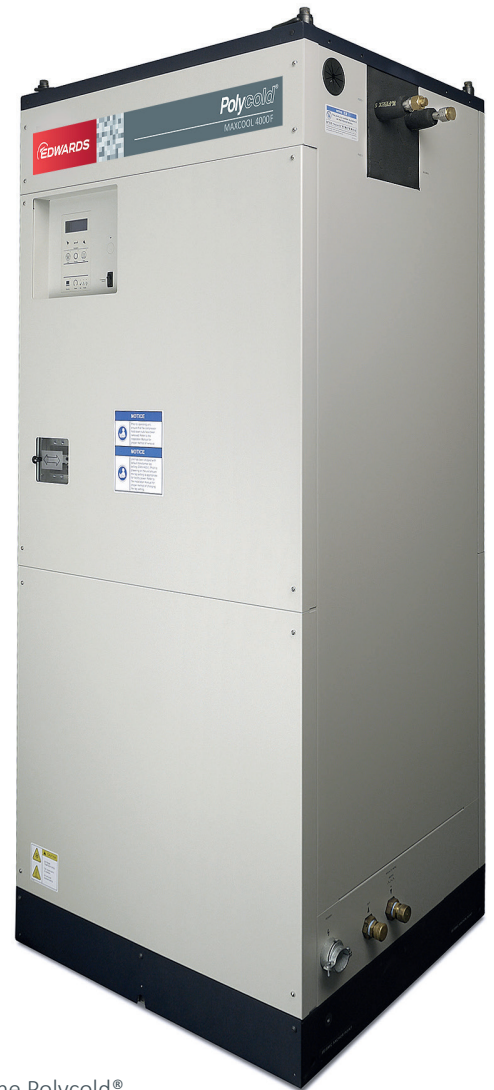
The Polycold® MaxCool 4000H is compliant with European Application Refrigerants (EC 1005/2009), the Montreal Protocol and the US EPA SNAP

MaxCool Cryochillers are the most cost-effective upgrade that you can add to any diffusion-pumped, turbo-pumped, or helium-cryopumped system.