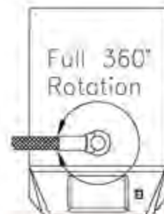
Turret Assembly Rotation: 360° of freedom around system base