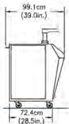
System Dimensions - Standard