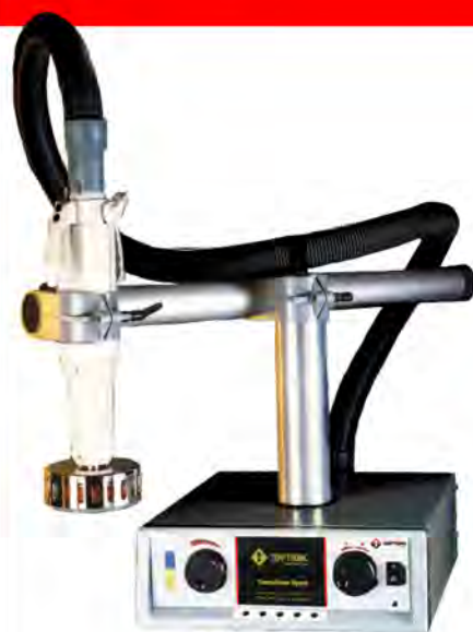
ATS-505 SHOWN WITH OPTIONAL THERMAL STAND